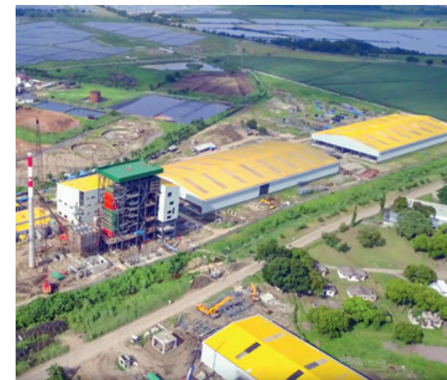
SAN CARLOS BIOPOWER (BioPower)

The result is a unique harmony of financial, ecological, and social returns – for investors, for the environment, and also for the local community.