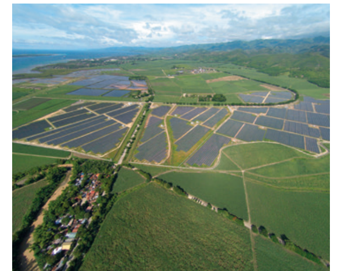
SAN CARLOS SOLAR ENERGY (SaCaSol/ISLASOL)

Renewable biomass power plant with a total output of 20 MW and electricity supply for 212,000 people